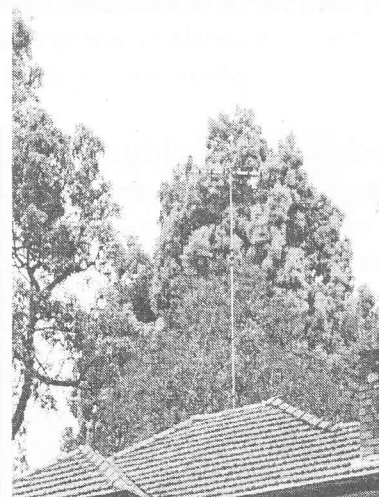
Tawny Frogmouth-The Crescent