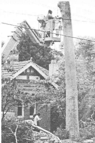
Welham St-power lines